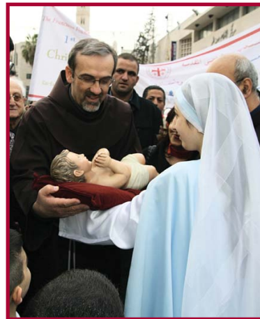
Fr. Custos accepts the traditional baby Jesus during the Children's Christmas Peace March

Jerusalem is the faith-point of every Christian believer - the spiritual hometown of us all. Our Catholic heritage links us through faith and fellowship with all our brothers and sisters in the Holy Land. As pilgrims on a journey to our "promised land," we are beckoned to sustain this Christian community with love, faith, pardon, peace and hope. We are invited to witness to the Light of Christ here as the Franciscans have done for more than 800 years.