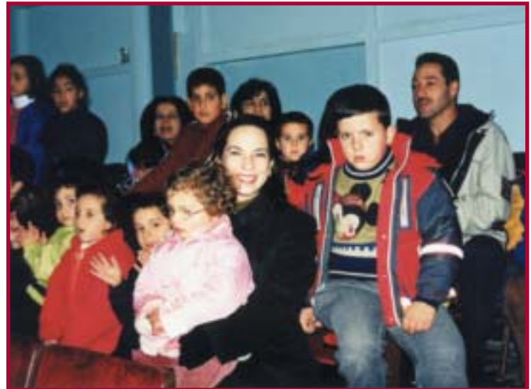
Families celebrate together at the Christmas program at the Catholic Action Center.

A special thanks to our partner and sponsor, the Franciscan Foundation for the Holy Land, which contributed $3000 to this "extravaganza celebration". The program was organized in cooperation with the youth attending the Franciscan Terra Sancta School, their scouts, and representatives from the different volunteer committees at the Catholic Action Club.