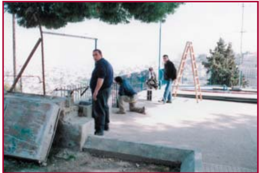
(Top) Workers for Project Hope clean and repair parking area for youth hostel. (Bottom) Workers paint fences at Social Center compound.