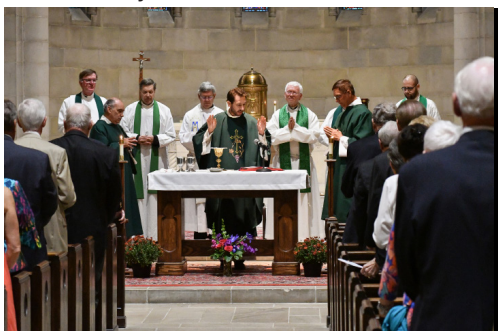
▲ Mass was held prior to the fundraising dinner.