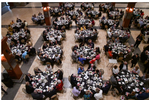
▲ Attendees at Cradling Christianity Benefit Dinner.