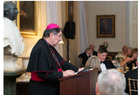
▲ Guest Speaker, Archbishop Christophe Pierre, DD, Apostolate Nuncio to the United States