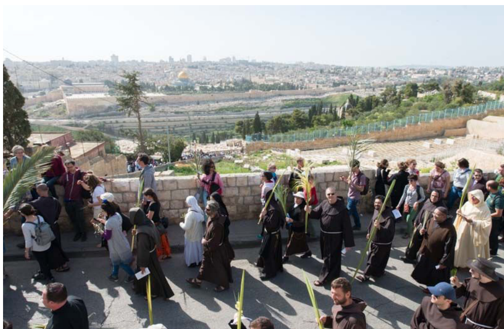
▲ Palm Sunday in the Holy Land

Days before He was to be crucified, Jesus rode into Jerusalem on a donkey on Palm Sunday - the last Sunday of Lent and the beginning of Holy Week.