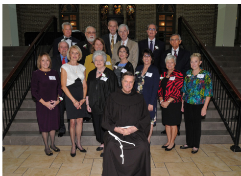
▲ The committee members for the event.