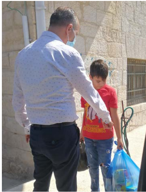
▲ Franciscan Foundation for the Holy Land has been dedicated to helping those in crisis during the Covid-19 pandemic.

(Continued: The Franciscan Boys Home: Making a Difference Even in a Pandemic)