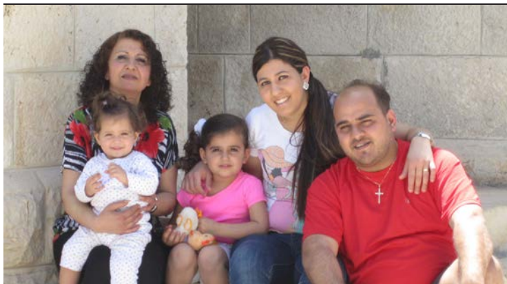
▲ One of the honored families to receive a housing gift

During a year that has seen a global pandemic of biblical proportions, the Franciscan Foundation for the Holy Land is especially grateful for the generous support from Christians around the world.