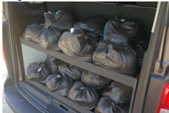
▲ FFHL has been providing assistance to families in need and those who have lost their jobs during this difficult time.

FFHL not only donated over $20,000 toward these food supplies, but also gave an additional $40,000 to help with critically needed medication for those affected