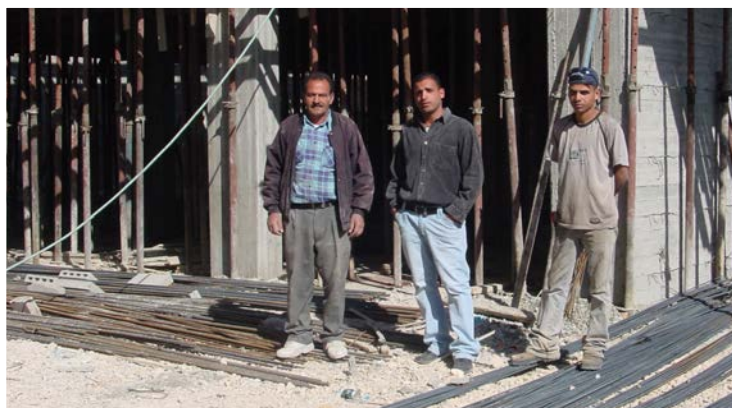
▲ The Housing Renovation Program provides double services. Workers are hired to build homes that are gifted to families in need.

If you would like to help our mission by making a gift to preserve Christians – the living stones – in the Holy Land, please visit www.ffhl.org/donate-now/ . ■