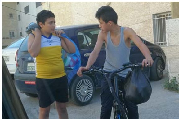
▲ FFHL has been focused on helping deliver supplies to the elderly and those who were not able to leave their homes because of COVID-19.

As followers of Jesus , we believe there is always a light at the end of a dark tunnel. If we are positive, we will eventually see the light. If we are not, then the light will take longer than expected. This analogy of light and darkness illustrates the Franciscan Foundation for the Holy Land's decision to assist those in need during the pandemic in the Holy Land.