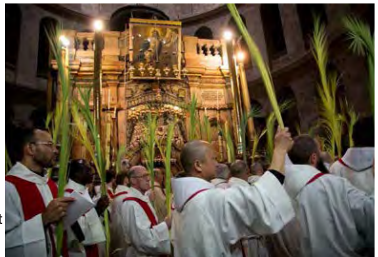
▲ FFHL.org Photo Archives 2015: Palm Sunday in the Holy Land (Church of the Holy Sepulchre)