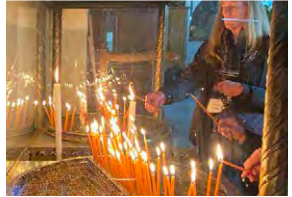
▲ Top Photo: Catholic Foundation Holy Land pilgrims at the statue of St. Peter in Capernaum. Bottom Photo: Catholic Foundation pilgrims lighting prayer candles at Calvary.