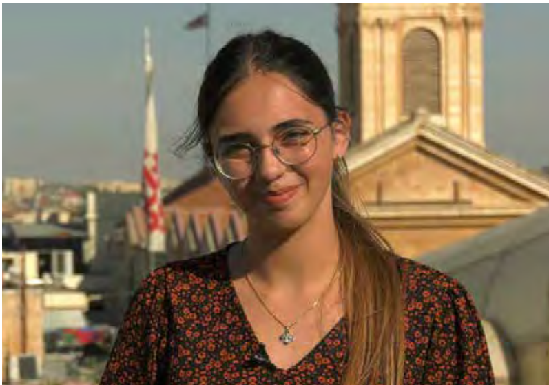
▲ FFHL supports Christian youth through the generosity of donors and awards 4-year scholarships to help strengthen the foundation of Christianity through education in the Holy Land.

Needless to say, we are most grateful for such magnanimity.