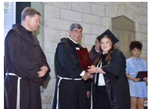
▲ University scholarship student receives diploma