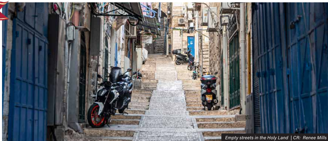
Empty streets in the Holy Land

The Franciscan Foundation for the Holy Land is a tax-exempt non-profit organization pursuant to Section 501(c)(3) of the Internal Revenue Code. All gifts to the Foundation are tax deductible. Please remember us in your will.