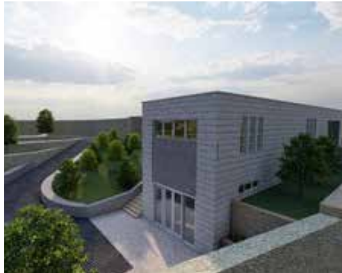
▲ Pilgrimage Center 3-D rendering