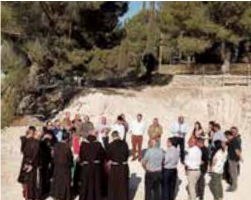
▲ Breaking grounds prayer at the new construction site for the Pilgrim Center