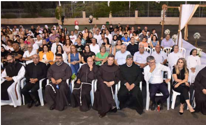
▲ The Bethlehem Terra Santa High School graduation ceremony

Elementary, high school and college education for Holy Land Christians has always been a priority for the Franciscan Foundation for the Holy Land. FFHL provides financial assistance for college scholarships, as well as some assistance to elementary and high schools students.