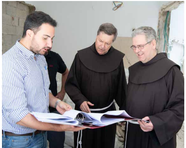
▲ All Photos: The start of construction of the new living quarters of the Holy Sepulchre Convent.

Recently, the Custodial Discretorium asked FFHL to help support the reconstruction of new rooms for the friars serving and ministering at the Holy Sepulchre. After speaking with one of FFHL's major benefactors about the request, he graciously agreed to fund the project to which we are most grateful.