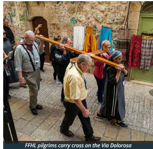
FFHL pilgrims carry cross on the Via Dolorosa

Jerusalem + Washington, D.C. + San Diego