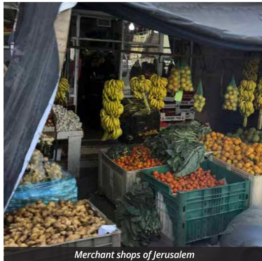
Merchant shops of Jerusalem