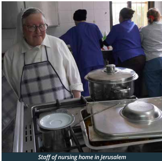
Staff of nursing home in Jerusalem

P.S. – Please use the enclosed card to send your prayer intentions. I will carry your intentions with me; and, as I pray in Gethsemane, I will not pray alone. As I walk the Via Dolorosa, I will not walk alone. As I kneel at Calvary, I will not kneel alone. We will pray, walk, and kneel together. I will also be honored to offer a Mass for your intentions during the Easter season.