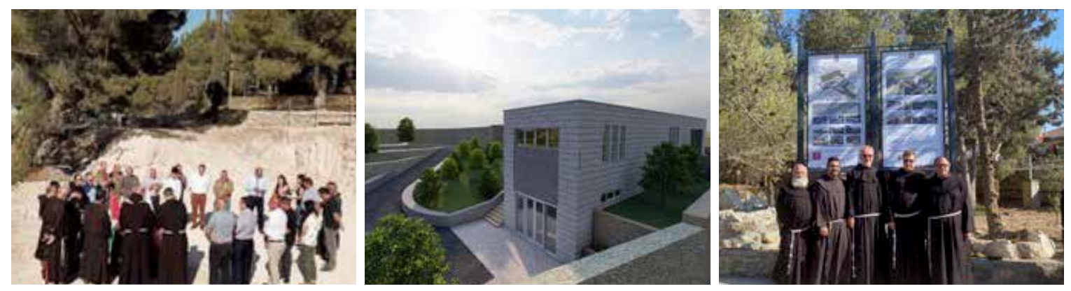
Breaking grounds prayer at the new construction site for the Pilgrimage Center