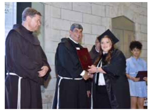
▲ University scholarship student receives diploma