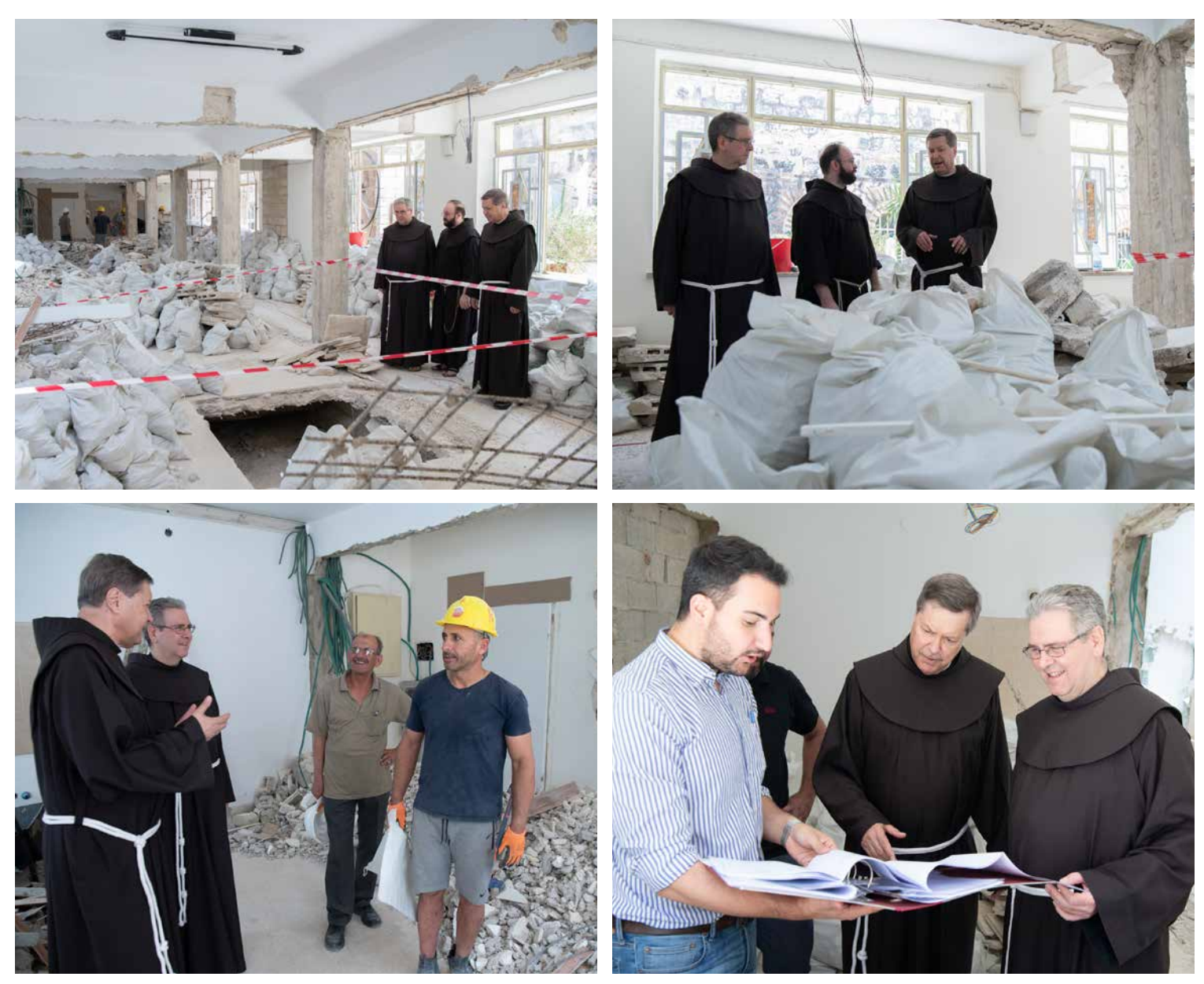
All Photos: The start of construction of the new living quarters of the Holy Sepulchre Convent.

Recently, the Custodial Discretorium asked FFHL to help support the reconstruction of new rooms for the friars serving and ministering at the Holy Sepulchre. After speaking with one of FFHL's major benefactors about the request, he graciously agreed to fund the project to which we are most grateful.