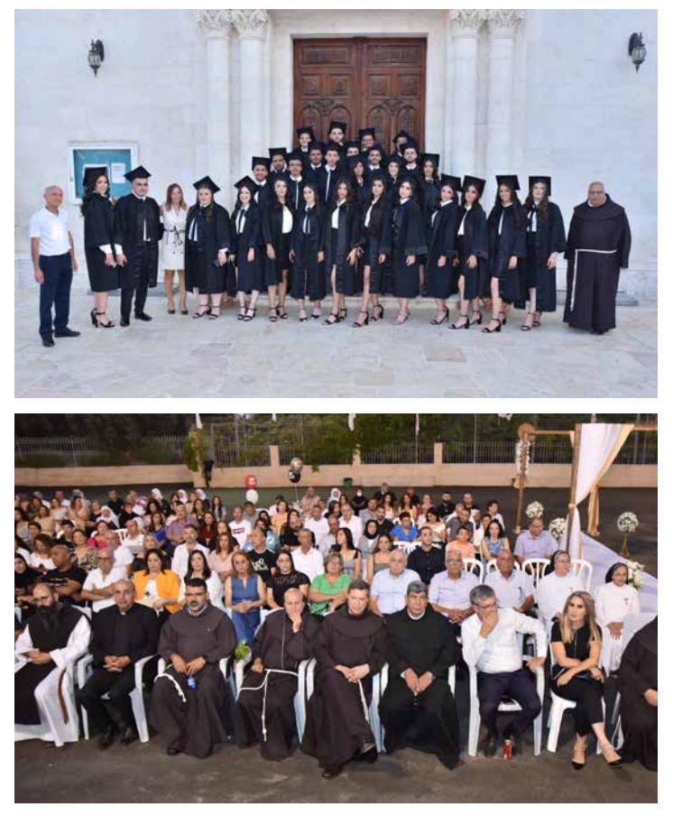
▲ The Bethlehem Terra Santa High School graduation ceremony

Elementary, high school and college education for Holy Land Christians has always been a priority for the Franciscan Foundation for the Holy Land. FFHL provides financial assistance for college scholarships, as well as some assistance to elementary and high schools students.