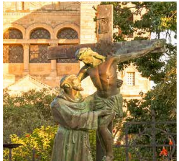
St. Francis Assisi with Jesus statue in the Holy Land

The Franciscan Foundation for the Holy Land (FFHL) exists to help our Christian brothers and sisters remain in the land of the Savior. Because of the generosity of our supporters like you, FFHL can provide essential educational and humanitarian resources to families in need and stem the exodus from the Holy Land.