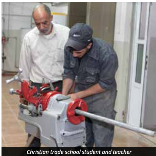
Christian trade school student and teacher

P.S. – Please find the enclosed card for sending your prayers. I will carry them with me to the Holy Land and offer them up to the Lord.