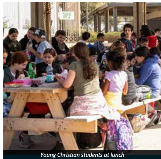
Young Christian students at lunch