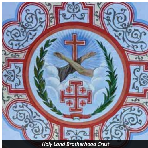
Holy Land Brotherhood Crest