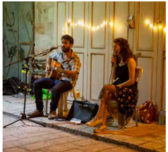
Street musicians play for tourists in Jerusalem