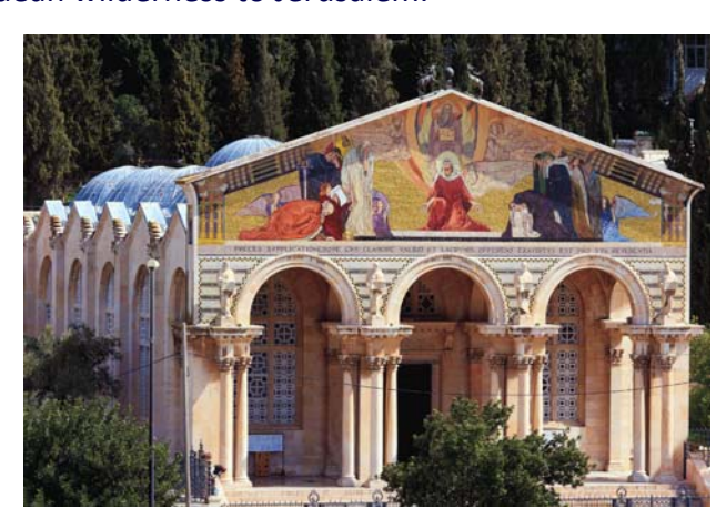
Day 7: Jerusalem

We will depart Galilee late this morning for Jerusalem. Drive along the shores of the Sea of Galilee to the Baptismal Site on the Jordan River where we will renew our baptismal vows. Continue via the Jordan Valley to Bet Shean, where we'll view from our coach an ancient Roman amphitheater. From here, drive through the Judean wilderness to Jerusalem.