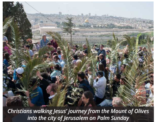
Christians walking Jesus' journey from the Mount of Olives into the city of Jerusalem on Palm Sunday

As faithful supporters of the Franciscan Foundation for the Holy Land, thank you for being a light in the darkness for many suffering Christians. As we observe Lent in the weeks leading up to Easter and the celebration of our risen Savior, please prayerfully consider a gift to help these men, women and children. Your philanthropic support helps us connect Christians with access to sustainable employment, safe housing, and life-changing education and provides essential resources and programs that enable them to remain and thrive in the birthplace of our Savior.