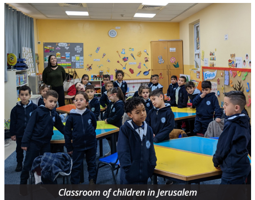
Classroom of children in Jerusalem