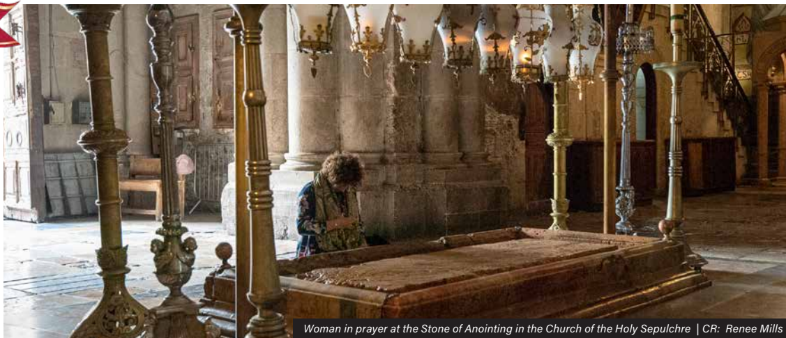
Woman in prayer at the Stone of Anointing in the Church of the Holy Sepulchre

The Franciscan Foundation for the Holy Land is a tax-exempt non-profit organization pursuant to Section 501(c)(3) of the Internal Revenue Code. All gifts to the Foundation are tax deductible. Please remember us in your will.