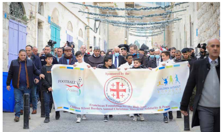
▲ FFHL sponsored Children Without Borders participates in the annual March for Peace.