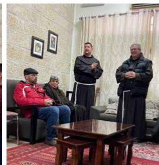
▲ All Photos: Celebrating kitchen remodel at Franciscan Boys Home in Bethlehem