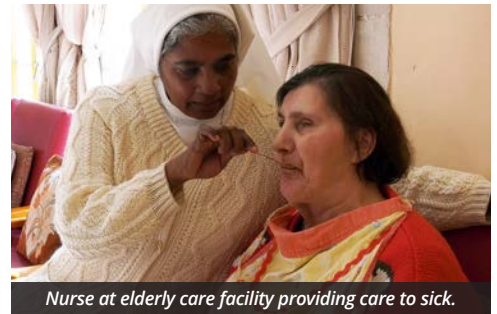
Nurse at elderly care facility providing care to sick.