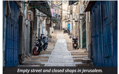
Empty street and closed shops in Jerusalem.

Their lives have been turned upside down by circumstances beyond their control and they are facing an uncertain future. Please prayerfully consider what you can do to make a difference in their lives and ease their worries. As a dear friend of FFHL, I ask that you remember their plight in prayer, and please consider making a New Year's gift to bring needed help to the Holy Land Christians. Through your generosity, many families will be blessed.