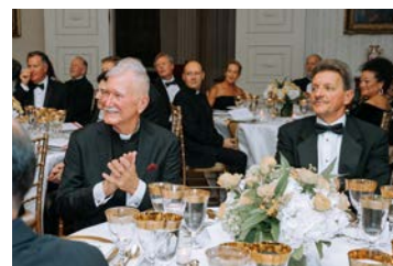
Attendees at the benefit dinner for FFHL