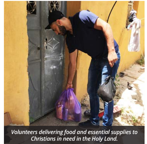
Volunteers delivering food and essential supplies to Christians in need in the Holy Land.

P.S. – Please find the enclosed card below for sending your prayers. We will carry them with us in the Holy Land and will offer them up to the Lord.