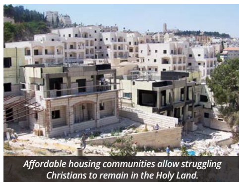
Affordable housing communities allow struggling Christians to remain in the Holy Land.

Because of the generosity of our supporters like you, FFHL can provide these essential educational and humanitarian resources to families in need to help stem the exodus from the Holy Land.