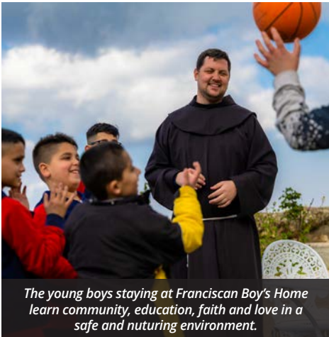
The young boys staying at Franciscan Boy's Home learn community, education, faith and love in a safe and nurturing environment.