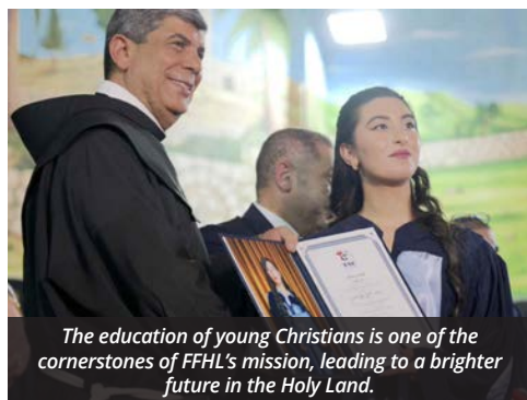
The education of young Christians is one of the cornerstones of FFHL's mission, leading to a brighter future in the Holy Land.