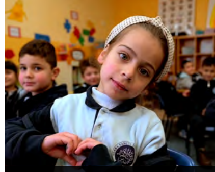
The education of children of all ages is one of the pillars of FFHL's mission in the Holy Land.