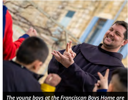
instilled with the virtues of community, love, guidance and faith in our Lord and Savior

We carry you with us in our prayers. Please share your prayers and intentions with us on the attached card below so that we may lift them up to the Lord during a mass in the Holy Land as we enter the New Year.